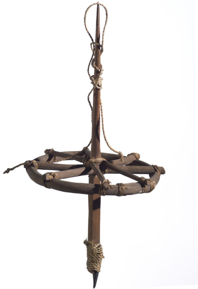
Pirori (string drill) with chert tip