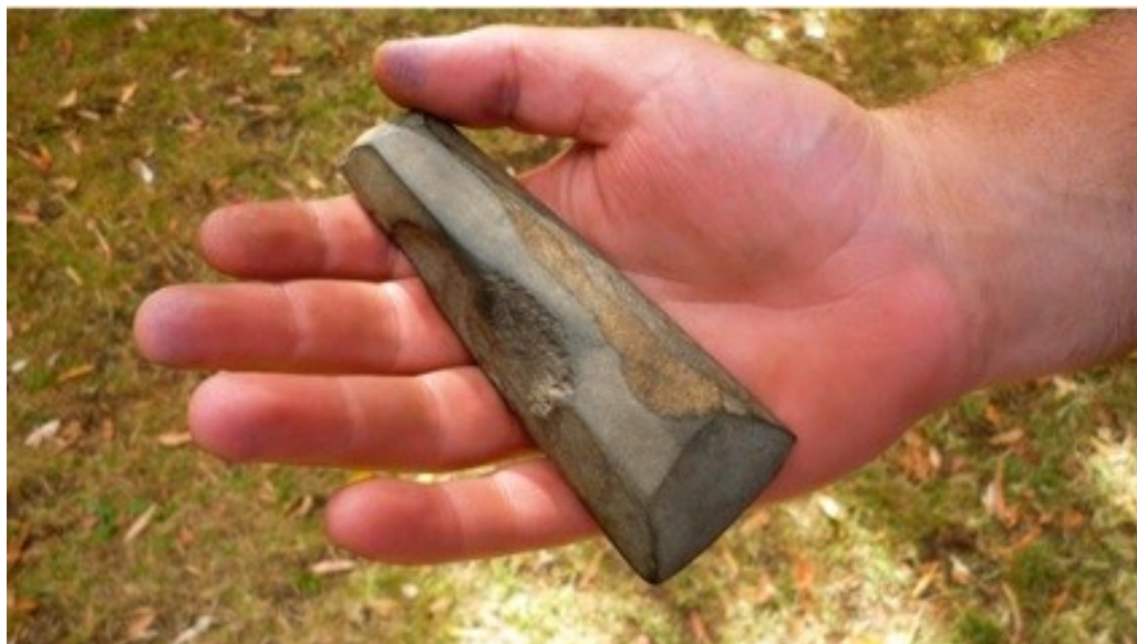
Toki made from Karā