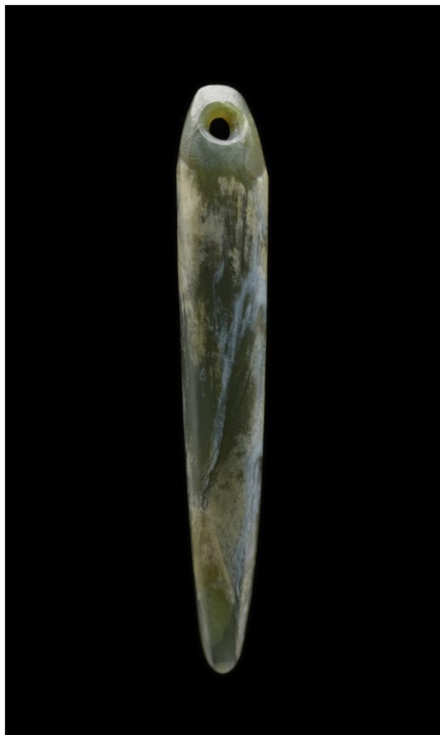
Mau Taringa (ear pendant)