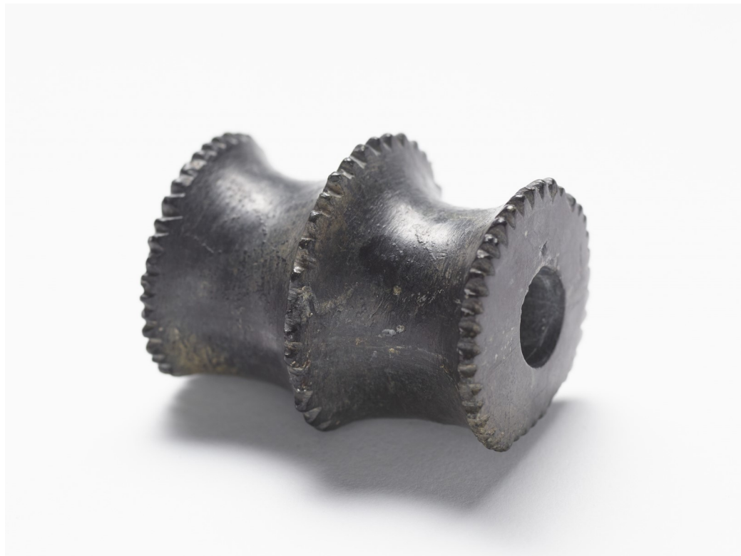
Mau kakī (reel necklace unit)