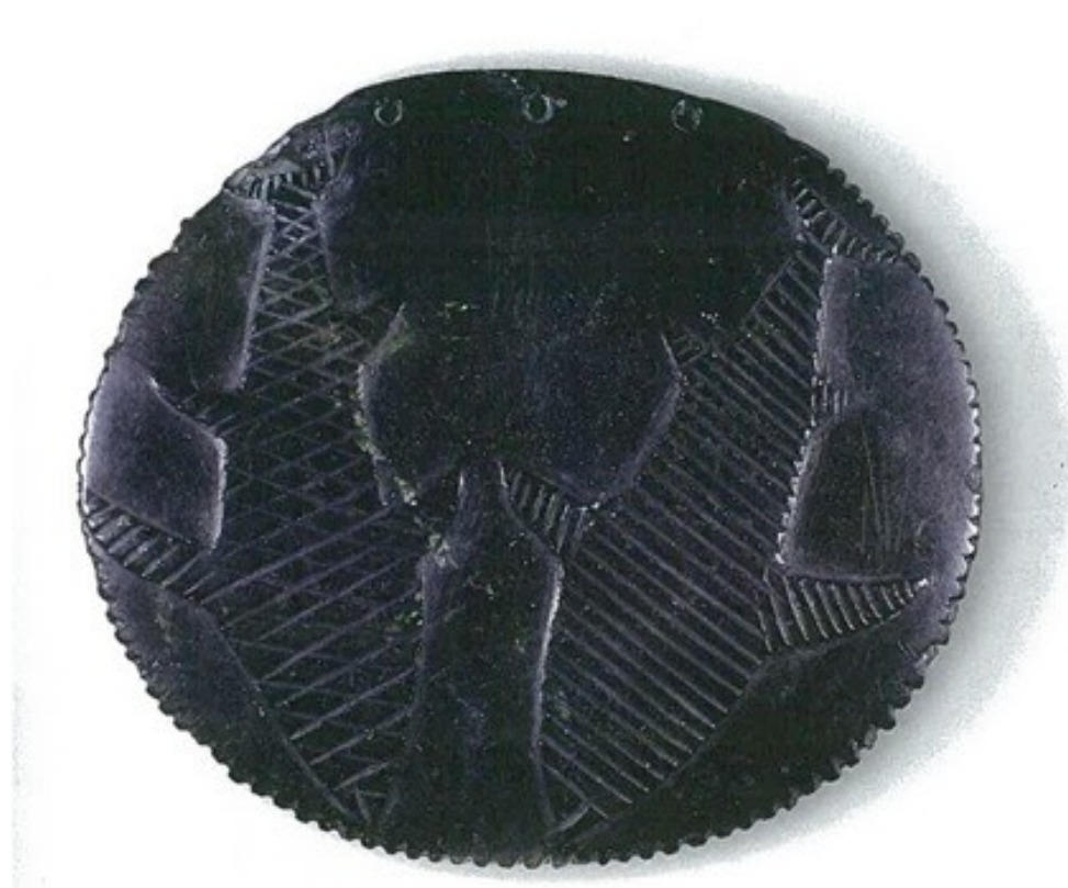
Whaturei, or Kōuma (pendant)

Canterbury Museum, Jessie Creative Cultures: E148-79