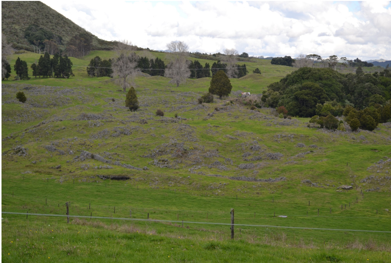
Stone gardening feature near Pakaraka.