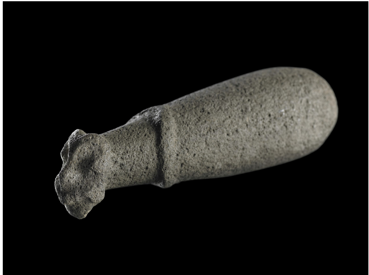
Te Papa Collection: ME001500

Patu Muku (stone pounders) for working flax fibre