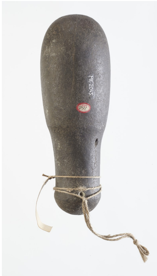
Te Papa Collection: ME002045/2