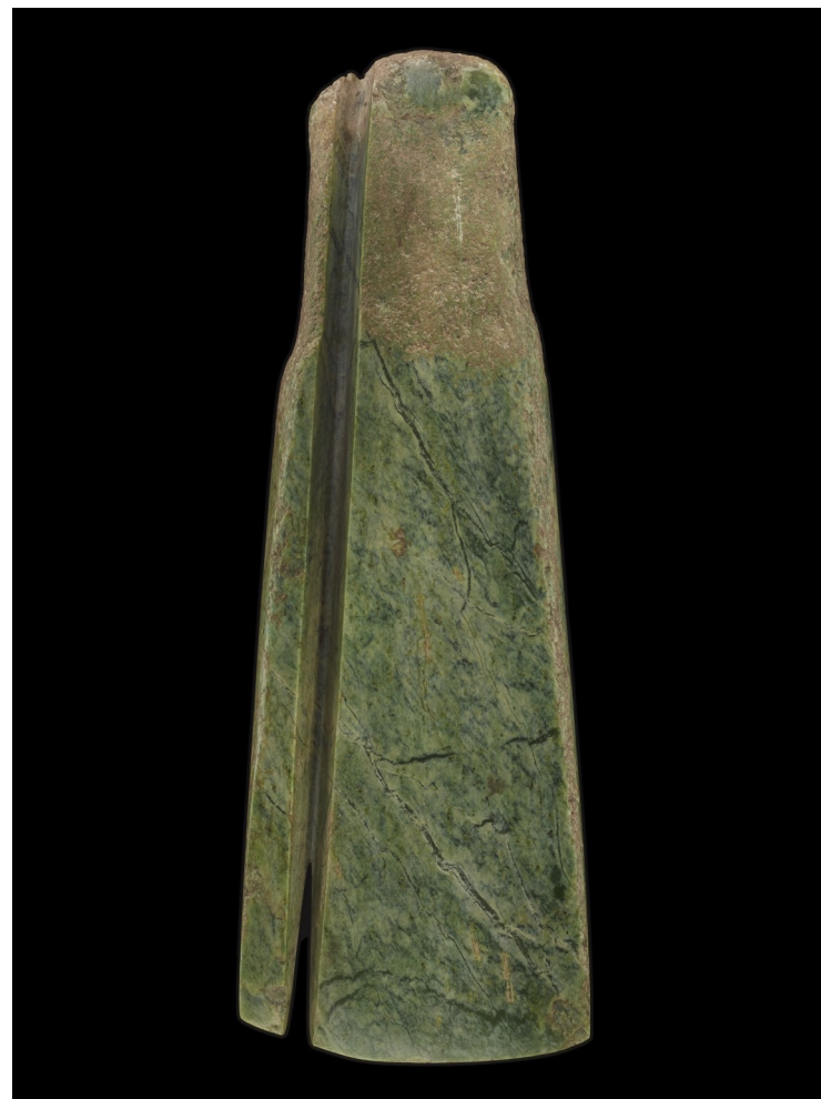
Toki Pounamu being cut