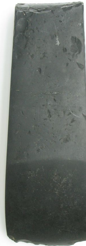
Toki (adze) blade