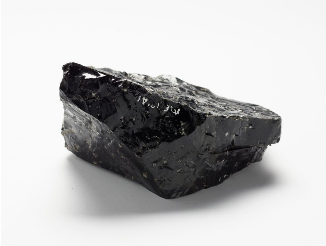
A sample of Matā (or Tūhua)—obsidian