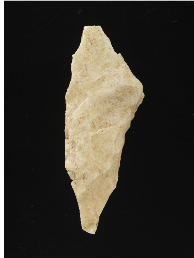
Whaorei, or Whao — drill tip made from kiripaka (chert).