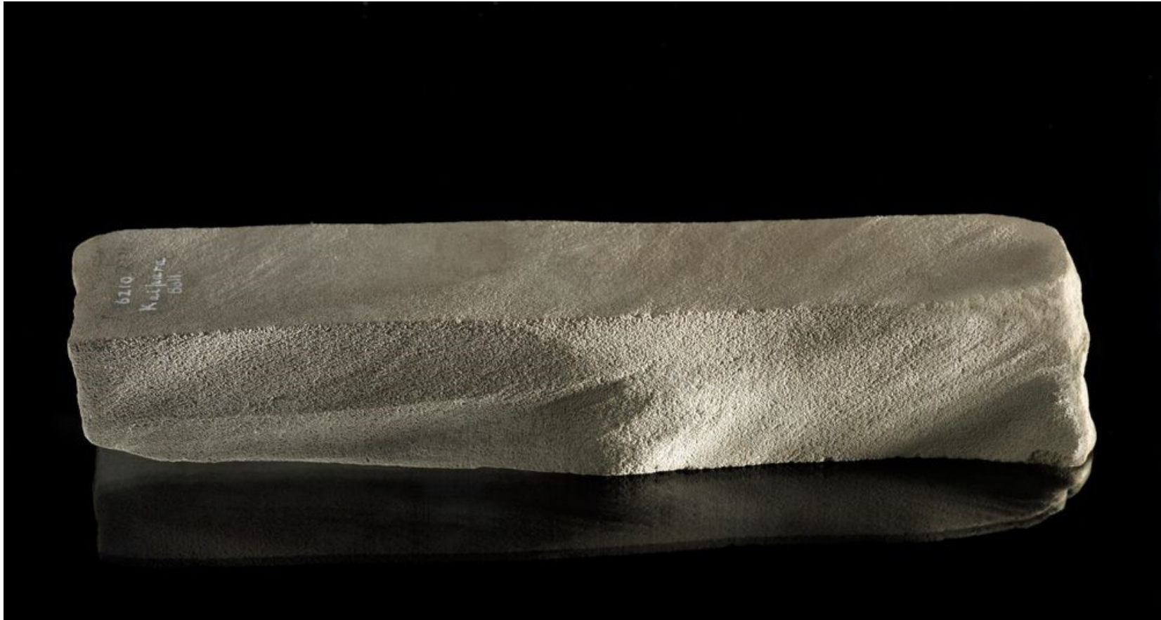
Hoanga (grindstone) made from Tunaেকে